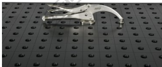
Shown on Welding Table Jaw Closed