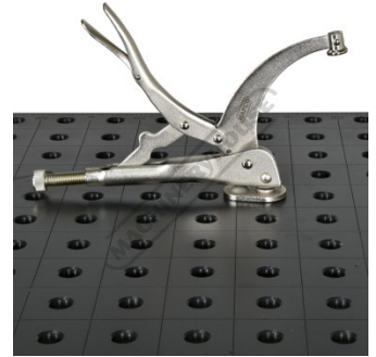
Shown on Welding Table Jaw Open