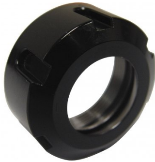
C117 Collet Nut ER32