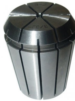
C903 ER32 Collet