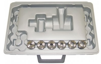
C921 ER32 Collet Set - 6 Piece