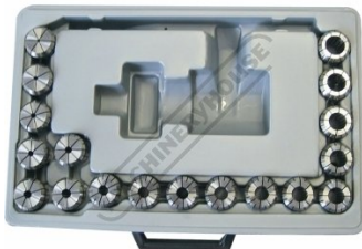
C922 ER32 Collet Set - 18 Piece