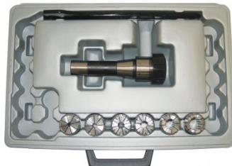
C923 Collet & Chuck Set - 8 Piece