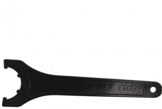
C117 Collet Nut ER32