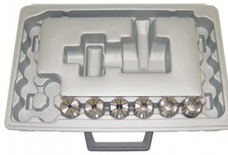
C921 ER32 Collet Set - 6 Piece