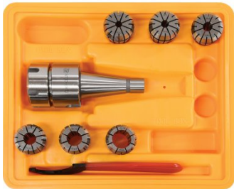
C9245 Collet & Chuck Set - 8 Piece