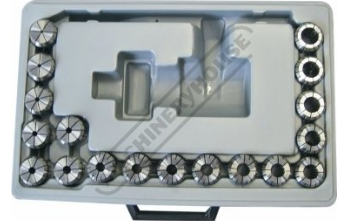
C922 ER32 Collet Set - 18 Piece