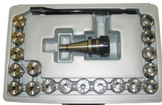
C928 Collet & Chuck Set - 20 Piece