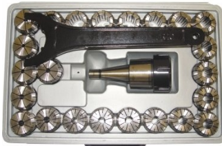
C965 Collet & Chuck Set - 25 Piece