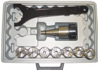
C961 Collet & Chuck Set - 9 Piece