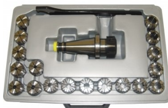
C929 Collet & Chuck Set - 20 Piece