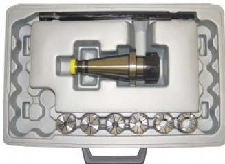
C925 Collet & Chuck Set - 8 Piece