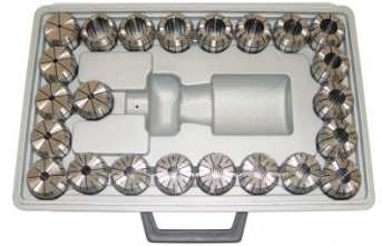
C958 ER40 Collet Set - 23 Piece