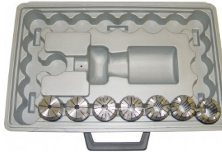
C957 ER40 Collet Set - 7 Piece