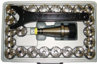
C966 Collet & Chuck Set - 25 Piece