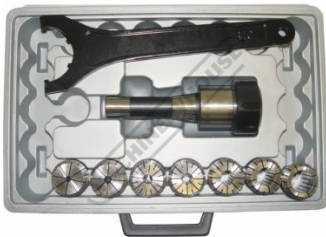
C964 Collet & Chuck Set - 25 Piece