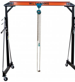
K088 Mobile Girder Rail Gantry Package Deal