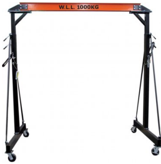
C188 Mobile Girder Rail Gantry