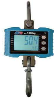
C191 Digital Crane Scale