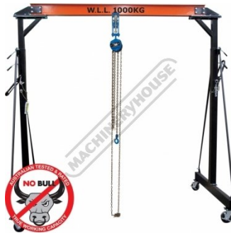
K090 Mobile Girder Rail Gantry Package Deal