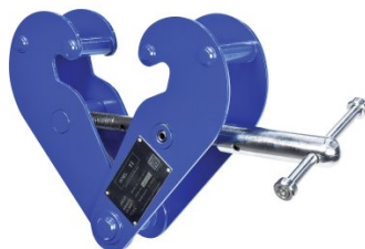
C146 Girder Clamp