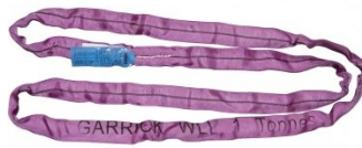
H305 Round Sling