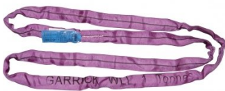
H308 Round Sling