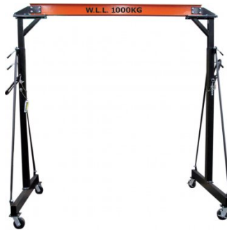
C188 Mobile Girder Rail Gantry