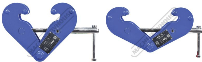
Front View 2