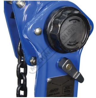
Lever Handle Mechanism