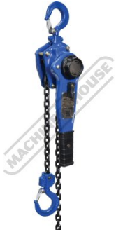
Main View Handle Down