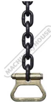
Length Chain End