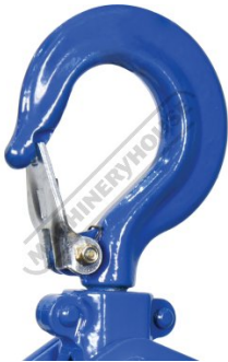
Top Hook Assembly