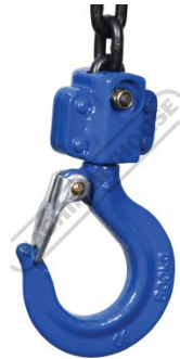
Bottom Hook Assembly