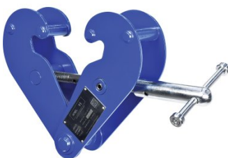
C146 Girder Clamp