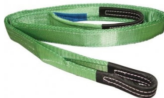
H322 Flat Sling