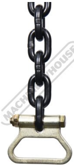
Length Chain End