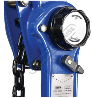
Lever Handle Mechanism