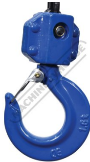
Bottom Hook Assembly