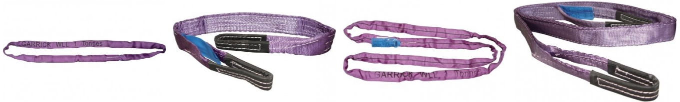
H308 Round Slings