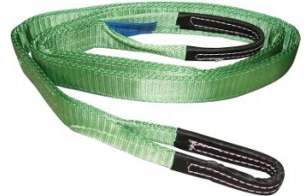
H324 Flat Sling