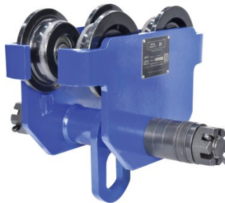
C148 Girder Trolley