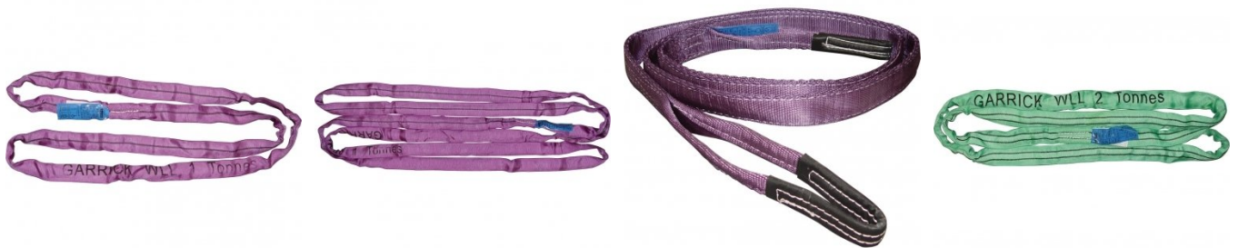
H310 Round Slings