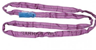
H305 Round Sling