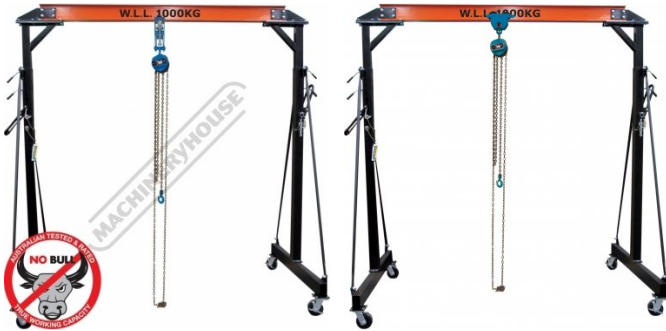
K088 Mobile Girder Rail Gantry Package Deal