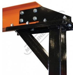
Heavy Duty Beam Support