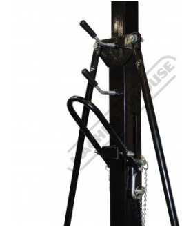
Lever Action Beam Height Adjustment