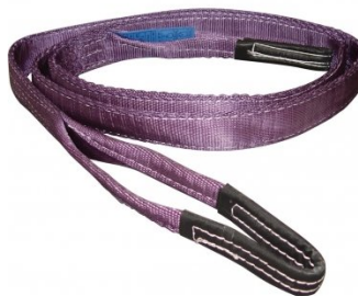
H320 Flat Sling