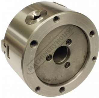
Back Plate Mount