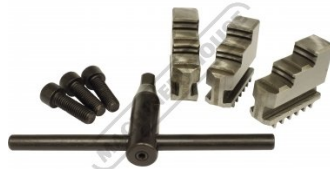
2 Included Accessories