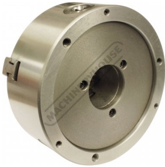
Back Plate Mount