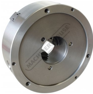
Back Plate Mount