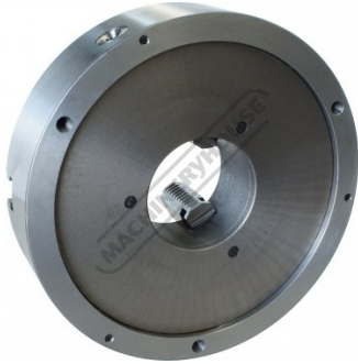
Back Plate Mount