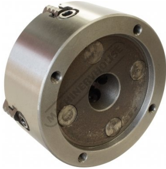
Back Plate Mount