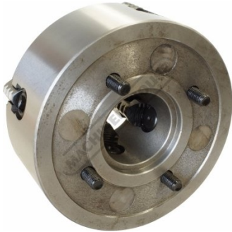
Back Plate Mount