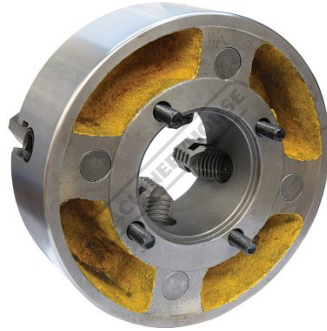
Back Plate Mount