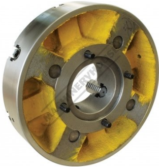
Back Plate Mount