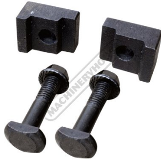
Nuts and Bolts