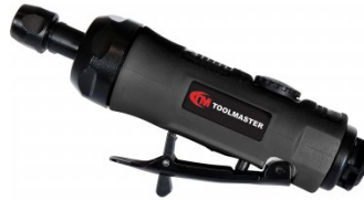
A040 Air Die Grinder