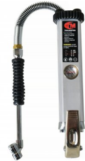
A264 Professional Tyre Inflator with Linear Gauge