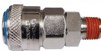
F945 High-Flow One Touch System Air Fittings