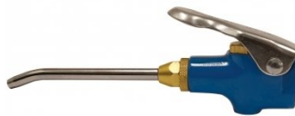
S440 Air Blow Gun