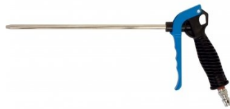
A251 Hi Flow Air Duster Gun