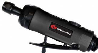
A040 Air Die Grinder