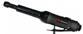
A041 Air Die Grinder - Extended Shaft 5" (127mm)