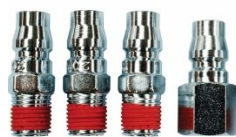
F935 High-Flow Air Fittings