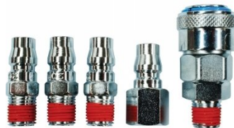
F935 High-Flow Air Fittings