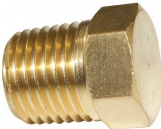
F870 Air Fittings