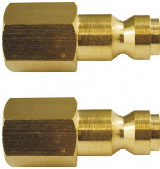
F903B Air Fittings