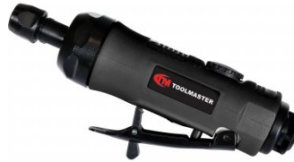
A040 Air Die Grinder