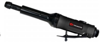
A041 Air Die Grinder - Extended Shaft 5" (127mm)