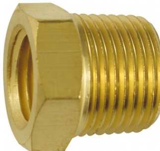
F832 Air Fittings