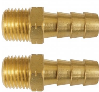
F803 Air Fittings