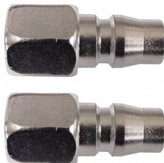
F950 High-Flow Air Fittings