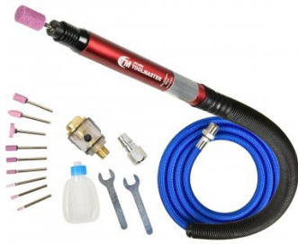
A043 Air Micro Die Grinder Kit