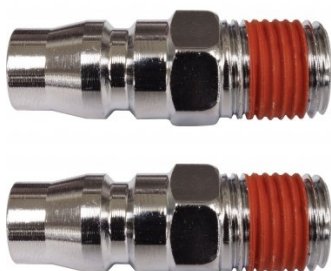
F951 High-Flow Air Fittings