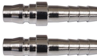
F955 High-Flow Air Fittings