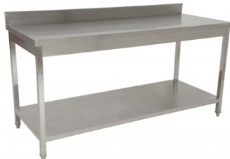
F298 Stainless Steel Bench with Splashback