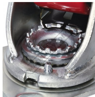
Ball Bearing Base With Greasing Nipple