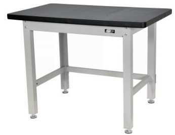
A415 Industrial Work Bench