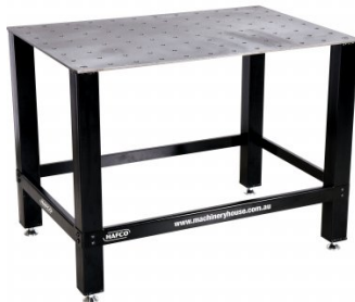
W08455 Welding Table