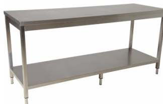
F280 Stainless Steel Island Work Bench