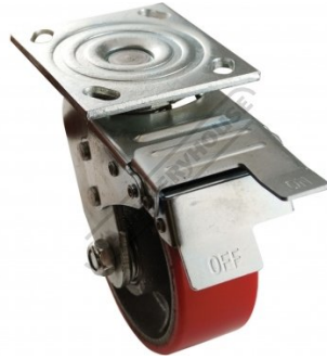
Foot Brake Released