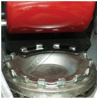
Foot Brake With Swivel Base Lock