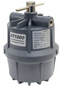
C492 Plasma Sub-Micronic Air Filter Canister