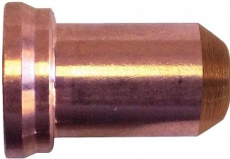
C625 1.0mm Cutting Tips