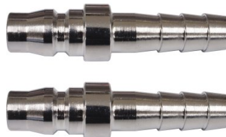
F888 Air Fittings