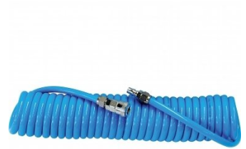
H018 Recoil PU Air Hose