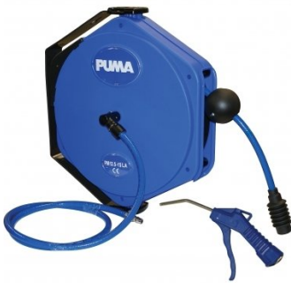
H045 Retractable Air Hose Reel - Includes Air Duster gun