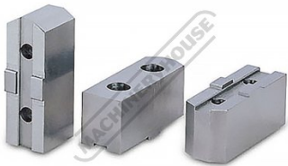
Optional Soft Jaws