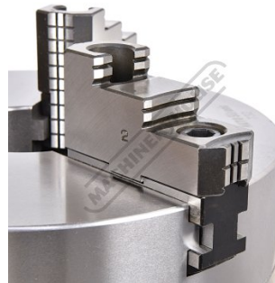
Jaw Rear View