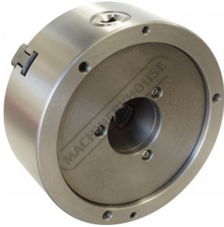
Back Plate Mount