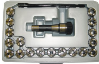
C927 Collet & Chuck Set - 20 Piece