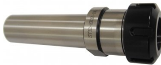
C931 32 x 100 x ER32 Collet Chuck - Straight