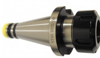
C112 Collet Chuck NT40 - ER32