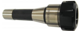
C106 Collet Chuck - R8 x ER32