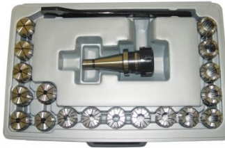
C929 Collet & Chuck Set - 20 Piece