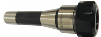
C106 Collet Chuck - R8 x ER32