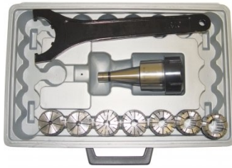
C962 Collet & Chuck Set - 9 Piece