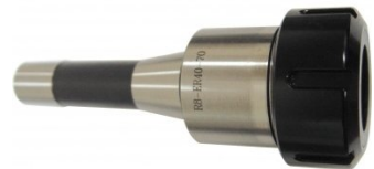
C138 Collet Chuck R8 x ER40