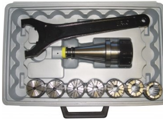
C964 Collet & Chuck Set - 25 Piece