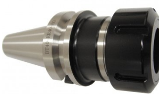
T226 BT40 x ER40-80 Collet Chuck