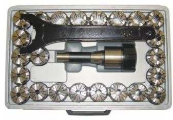
C964 Collet & Chuck Set - 25 Piece