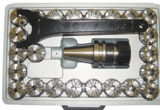
C138 Collet Chuck R8 x ER40