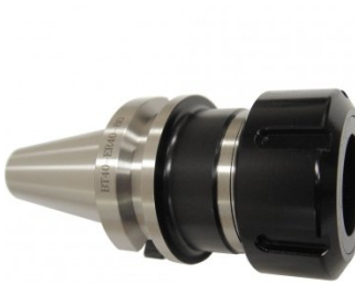
T226 BT40 x ER40-80 Collet Chuck