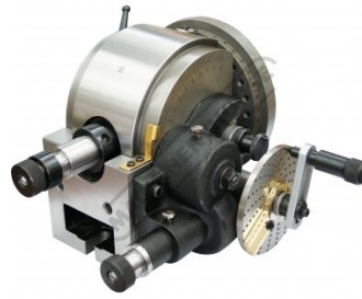
Rear View 2