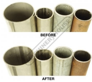
Material Before and After