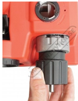
Grinding the Drill Operation