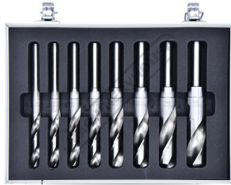
Case Top View