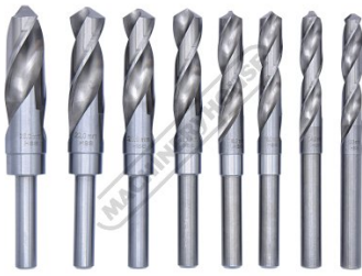
Metric Reduced Shank Drill Set