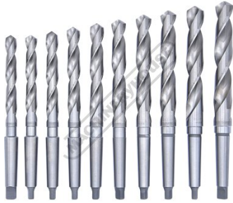
Metric 2MT HSS Drill Set