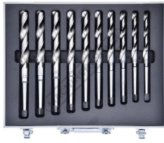
Case Top View