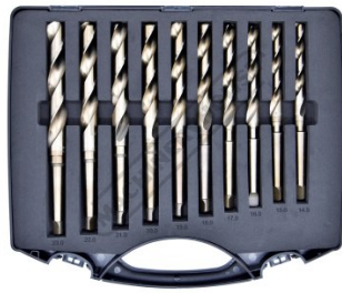
Case Open Top View