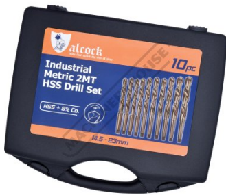
Case Top View