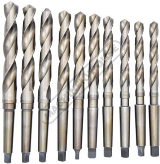
Drill Set Top View